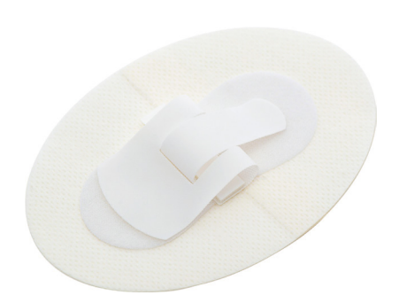
Optional Securement Device (sold seperately)